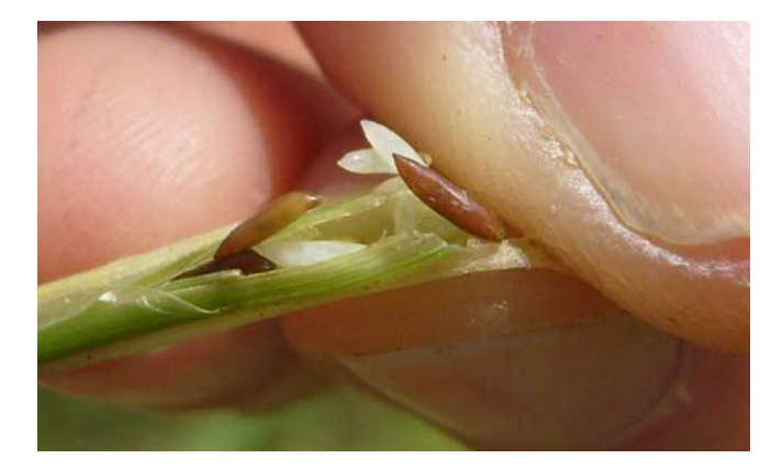
You may find more than one Hessian fly larvae or flax seed behind a leaf sheath. There were more than 7 larvae and flax seeds infesting this tiller.