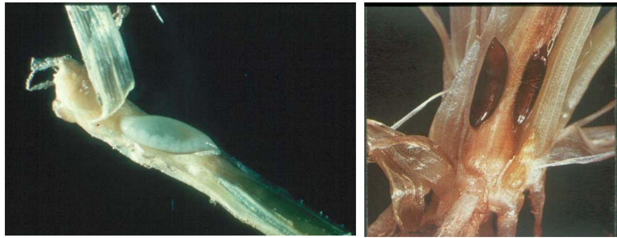
"Green gut" (older Hessian fly larva)